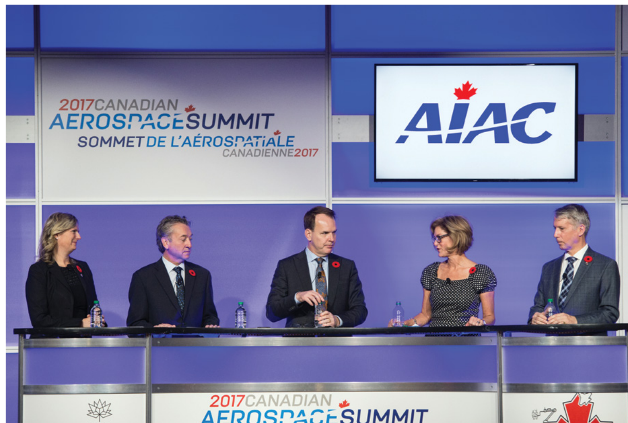
Summit Parliamentary Secretaries Panel. Left to right: Leona Alleslev, Chair, Liberal Aerospace Caucus (moderator); Jean R. Rioux, Parliamentary Secretary to the Minister of National Defence; Steven MacKinnon, Parliamentary Secretary to the Minister of Public Services and Procurement; Pamela Goldsmith-Jones, Parliamentary Secretary to the Minister of International Trade; Hon. Andrew Leslie, Parliamentary Secretary to the Minister of Foreign Affairs.