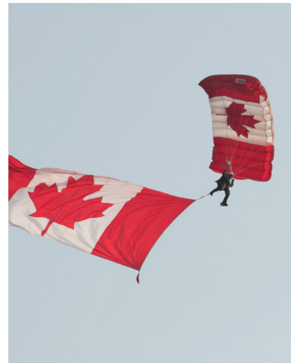
Parachutists display the Canadian flag at the opening of the Twilight Dinner and the Abbotsford Air Show.