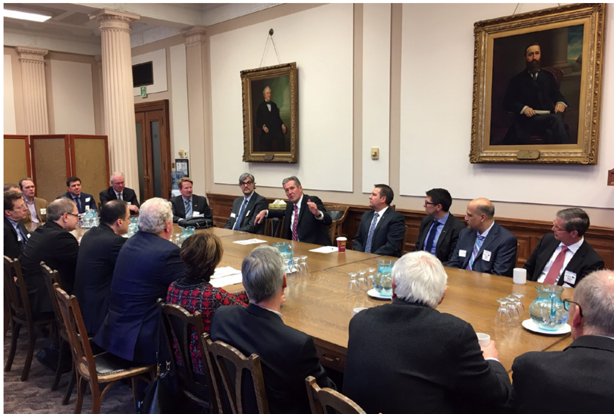
Hon. Brian Pallister, Premier of Manitoba, speaks to AIAC's Board of Directors in March 2017.