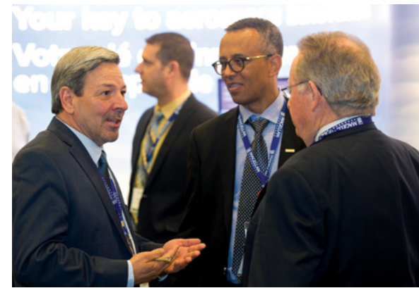
Summit attendees network at the B2B and Trade Show.