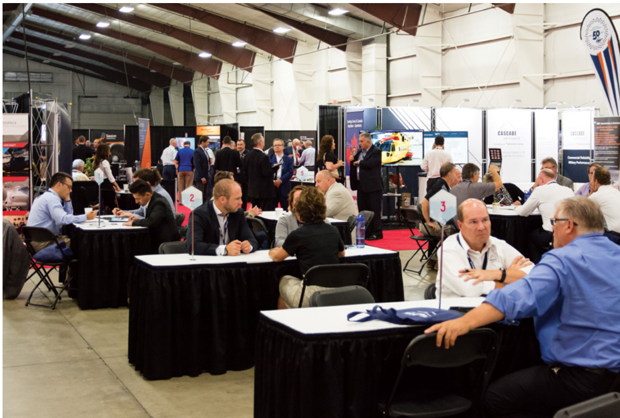
B2B meetings underway at the ADSETrade Show.

We expect the rapid pace to continue over the next year. In 2018, AIAC will: